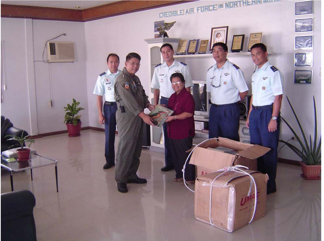
Principal of Bethany School receiving books from Move On Philippines.